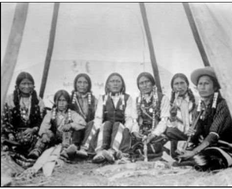
Jicarilla Apache woman, boy and men seated inside a tepee, 1898