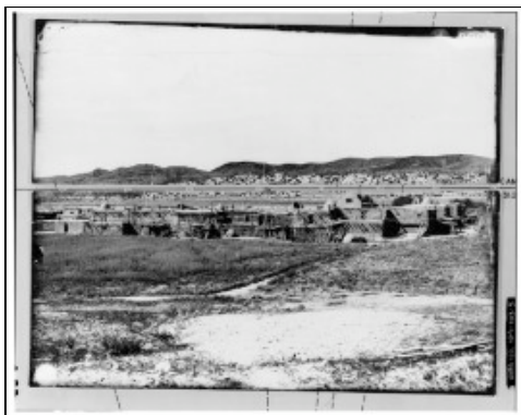
Tesuque Pueblo 1973