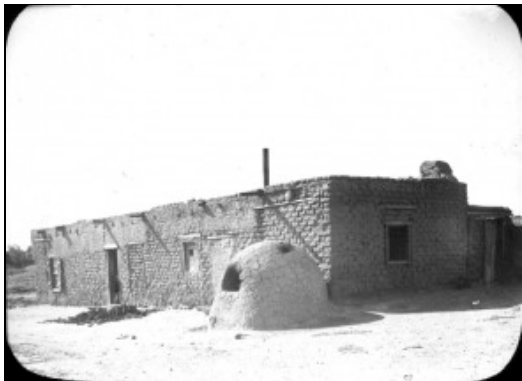
House in Santa Fe