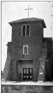
San Miguel church, the oldest in America