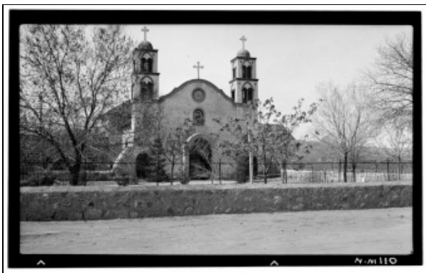
San Miguel Mission, Socorro