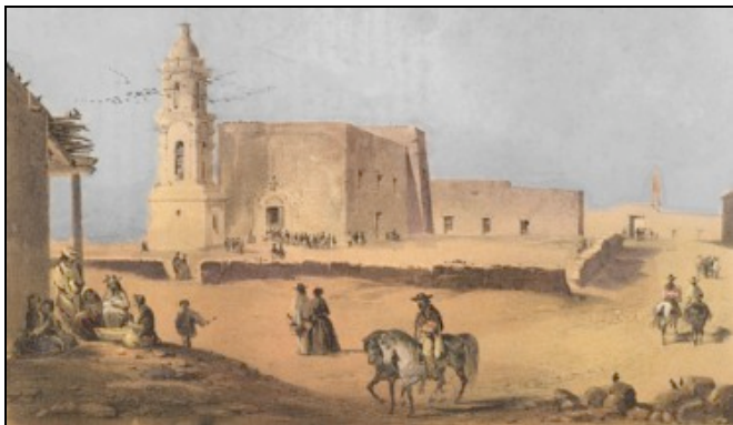
The Plaza and Church of El Paso