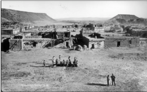
San Felipe Pueblo with Santa Ana Mesa in the background