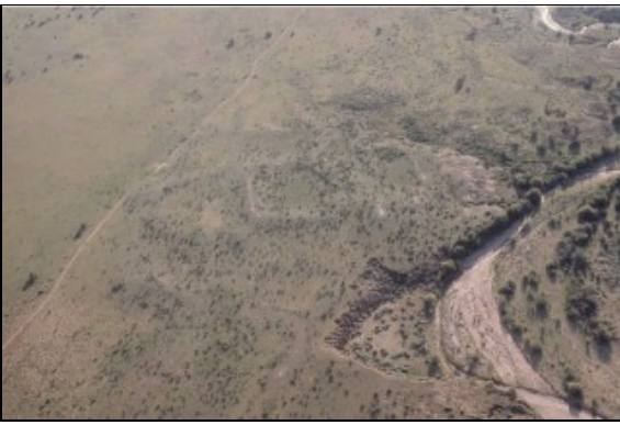
Aerial view of the ruins of Galisteo Pueblo