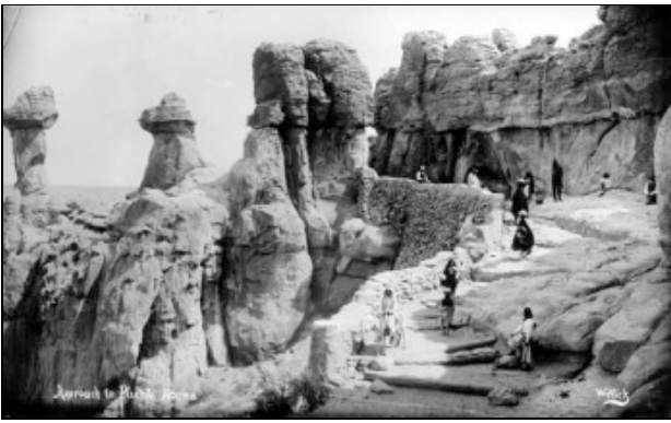
Approach to Acoma Pueblo from the south 1880-1890