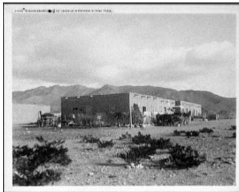
Mexican adobe house, Mt. Franklin in distance, El Paso, Texas. 1907