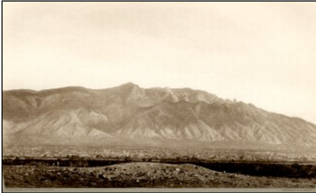
Sandia Mountains, the Rio Grande near Bernalillo, foreground, ruins of Tur-jui-ai